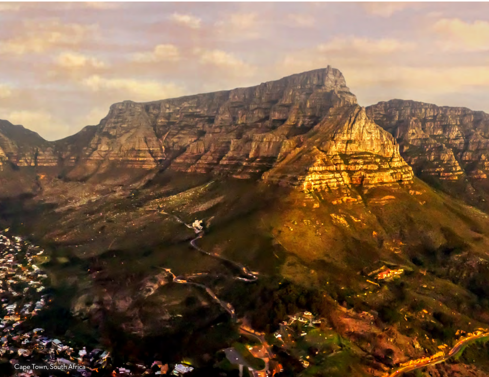
Cape Town, South Africa