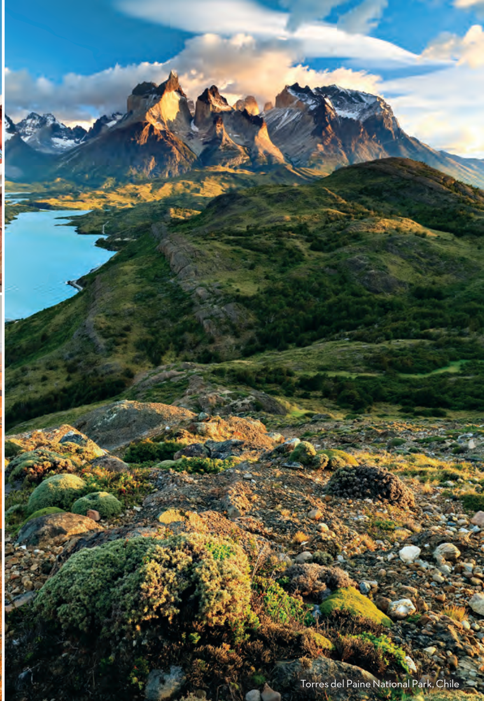
Torres del Paine National Park, Chile