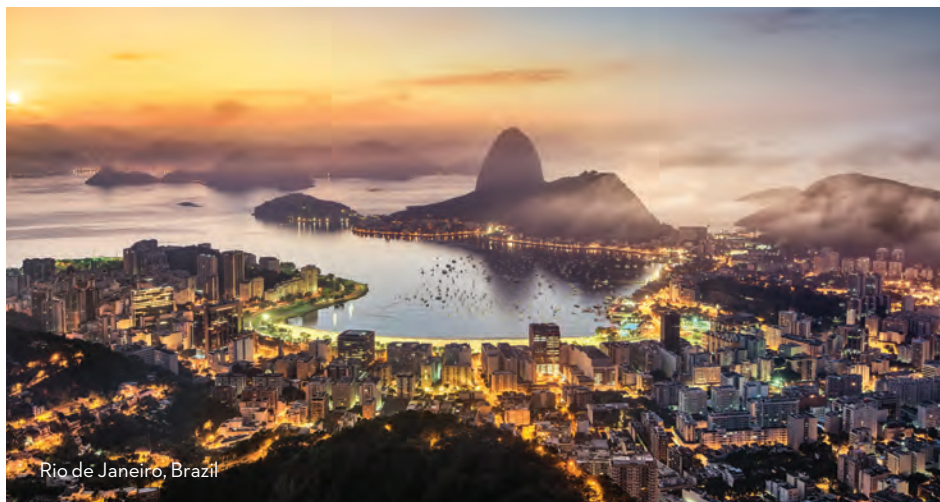
Rio de Janeiro, Brazil

Each of our ships is equipped with limited medical facilities that are staffed by a physician and registered nurses. Unless otherwise indicated in an active HAL policy (for example, the COVID-19 Protection Program), guest will be charged a fee for all medical services and medications obtained on board. If the onboard physician is unable to care for your needs on board, you will be transferred to medical facilities on shore. If your condition will require that you have special medical apparatus or assistance on board, we must be made aware of that at time of booking in order to determine whether we can accommodate your needs.